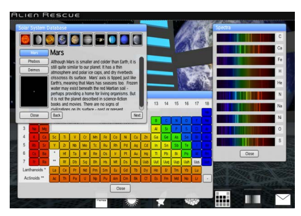
(c) Using Solar System Database to collect data and use Periodic Table and Spectra to interpret data