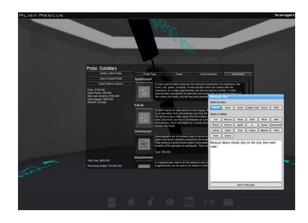
(e) Designing a probe in the Probe Design Center