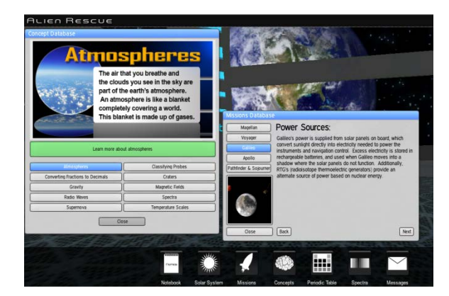
(f) Learning the essential concepts in Concepts Database and past NASA missions in Missions Database