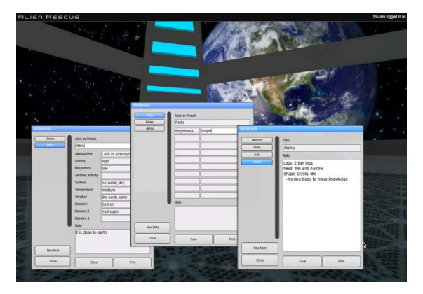
(b) Taking notes during researching on Solar System; the Notebook has three levels of scaffolding from more structured to less structured