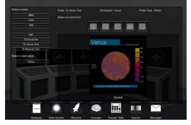
(d) Viewing the data returned from the probe in the Mission Control Center